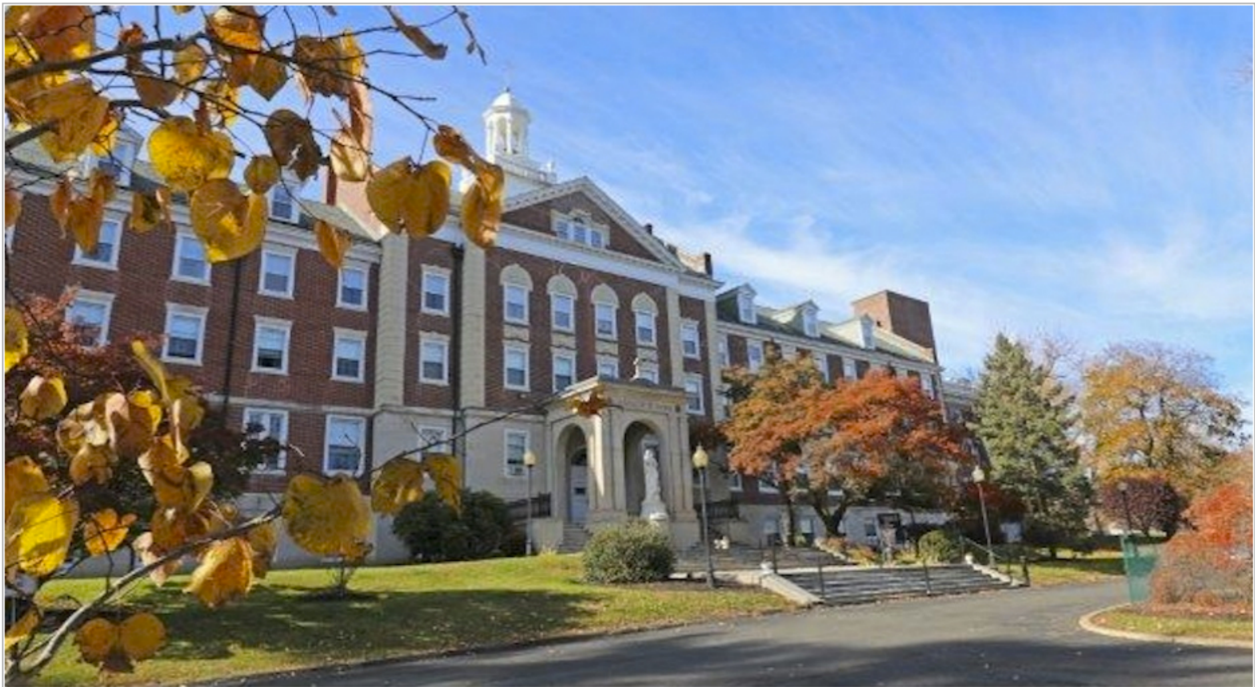
The Convent of St. Dominic serves as the headquarters of the Dominican Sisters of Blauvelt in Blauvelt, N.Y.

A holistic efficiency historic renovation initiative brings an historic building into the 21st century, helping a New York convent achieve an estimated 60% energy savings.